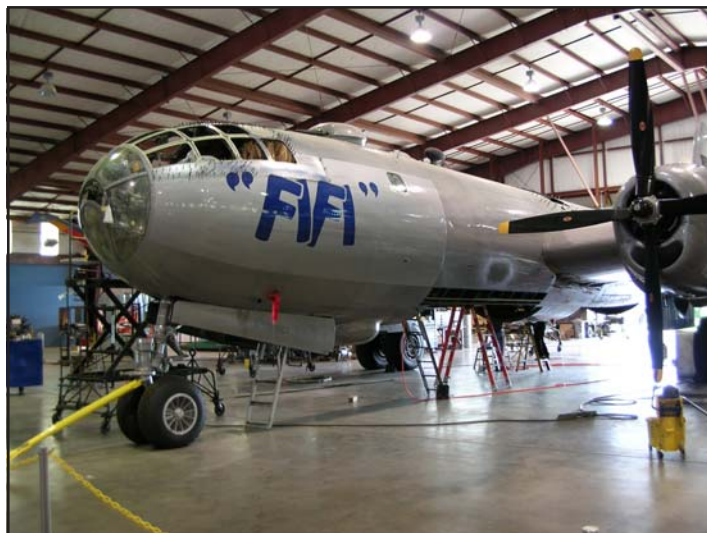
The nose section of FiFi comes back together.

The plane was pulled out of the hangar a week or so ago and the engines run up, which is another good sign of progress. One last major project is to finish rebuilding the left outer wing panel, show to the left and below. This needs a number of ribs replaced before it can be re-skinned and reattached.