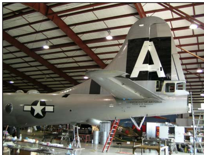
Above, the rudder is back on and below, the left outer wing panel that still has to be finished.

Keep in mind that all of the real structural work has to be done by or closely supervised by appropriately licenced and experienced folks.