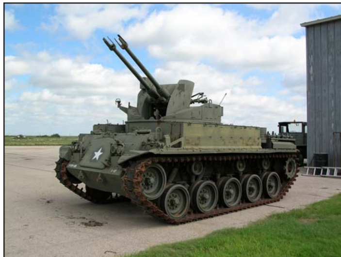
The M-42 Duster on the ramp at the CAF.

As many of you know, the AAH Museum has been trying to finalize the loan of an M-42 Duster self-propelled twin-40mm antiaircraft gun for some time and the Duster has finally arrived in Midland.