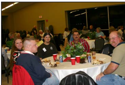
The dinner was held in O'Brien Hall in the CAF Commemorative Center.