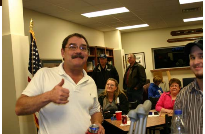
Super Bowl 2009 party images. Everyone had a great time, young and not-so-young alike!