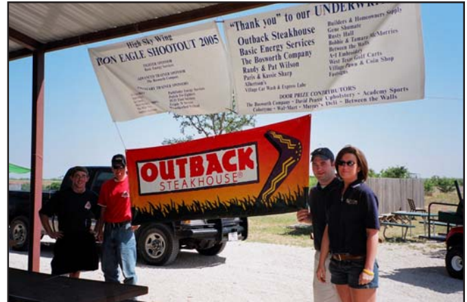
Outback Steakhouse was a major supporter, donating the great lunch for the shooters and workers.

I hope to see you all at the next Wing meeting, this coming Thursday, June 23rd. Don't forget to bring a covered dish so we can all enjoy each other's company over dinner. I understand that we have a veteran of the South Pacific theater of WWII as our speaker but unfortunately don't have any other information about him as this goes to press. See you there!