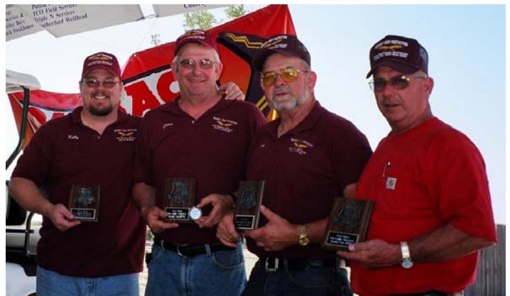
The Miller Boys team displays their first place plaques for the Double Ace group. Again, thanks to you all.