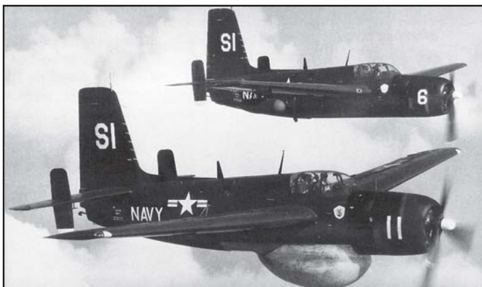
A pair of Grumman Guardians, the radar-equipped AF-2W in front with the weapons-carrying AF-2S behind.

Last month’s mystery photo was of a Grumman AF-2S Guardian, the strike version of a post-WWII pair of submarine hunter-killer designs. The second of the pair, the AF-2W, carried an airborne radar, while the AF-2S carried antisubmarine weapons for attack.