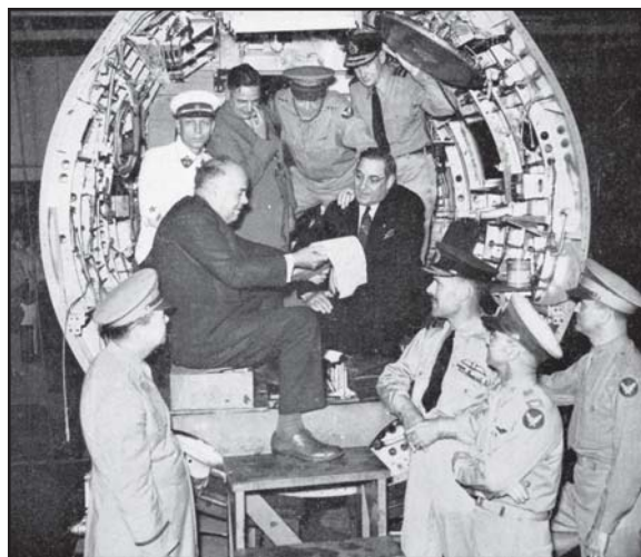
Three air force chiefs, Arnold of the USA, Belyaev of USSR and Evill of Great Britain, with Chrysler officials inspect B-26 construction progress.

Once America had been thrust into the war, Chrysler took on the production of Boeing’s B-29 Superfortress as well as its Wright R-3350 engines.