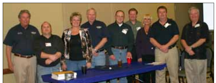
Your old and new High Sky Wing staff officers for 2011.