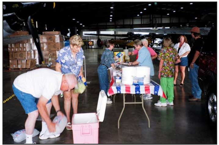
High Sky Wing members pitch in to make the Airsho Volunteer dinner a great success — again!

I know that Gena will have much to say about the Wing's activities coming up in two weeks. The Cantina is always a popular spot for everybody, but we always need help in making it run smoothly. The Special Show seems to be another area where High Sky people make it happen. Please consider volunteer-